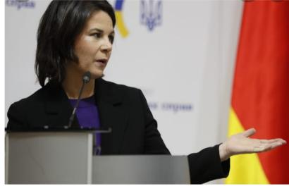
Annalena Baerbock German Foreign Affairs minister